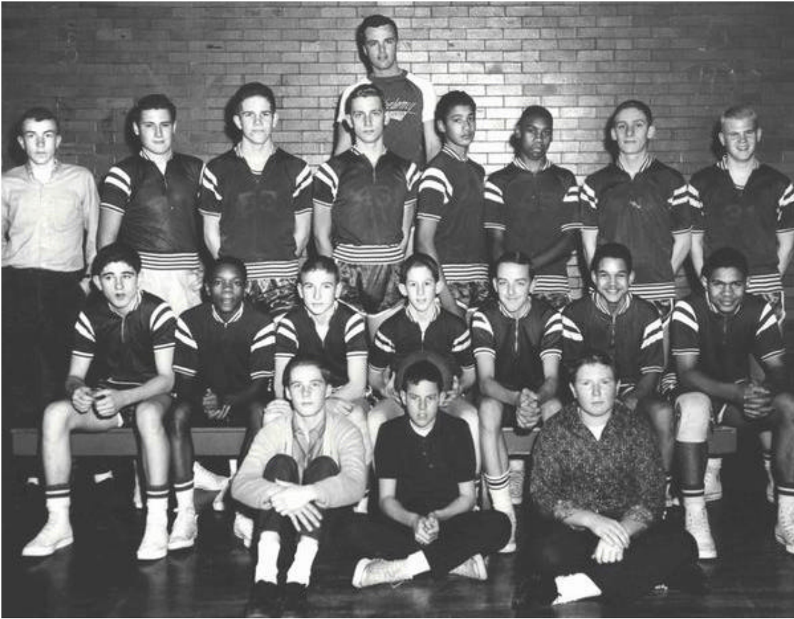
The Central Junior High Freshman Basketball Team 1963-64